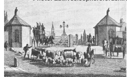
A turnpike in Ross