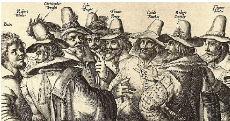
A contemporary engraving of eight of the 13 Gunpowder Plot conspirators by Crispijn van de Passe

Remember, remember The fifth of November Gunpowder, Treason and Plot I see no reason Why Gunpowder treason Should ever be forgot.