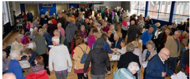
Last year's Open Day drew a big crowd

However, if you are not sure what might be of interest to you then please come along to our annual OPEN DAY on November 18 , 2.30pm, in the Paxton Hall at the Larruperz Centre. A representative from each of the groups on offer will be available to give you an idea what the group is about, where they meet and when. You can record your interest on a form that will be given to you on entry. Even if the group is full please show your interest and we can place you on the waiting list. Once you have perused the groups on offer why not visit the Watkins Room for a cream tea and have a chat with friends.